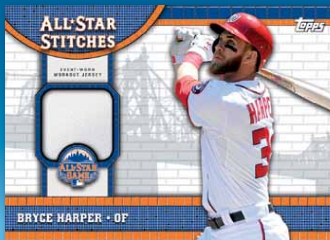
All-Star Stitches Card