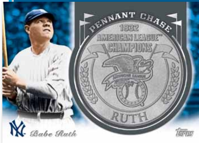
Pennant Chase Coin Card - Steel Parallel

Pennant Chase Steel Parallel – Sequentially numbered to 10.