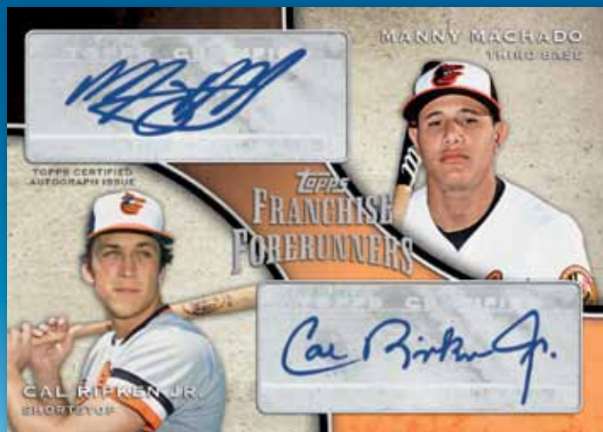
Franchise Forerunners Dual Autographed Card

Franchise Forerunners Dual Autographs – 10 dual-auto cards. Numbered to 10.