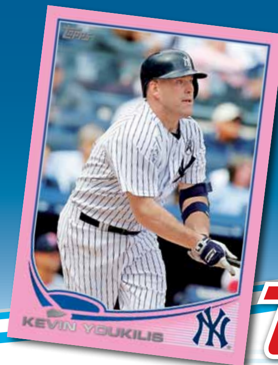
Base - Pink Parallel

NEW! Sapphire Foil Full Parallel – A full 990-card parallel of Series 1, Series 2, and Update Series cards on sapphire blue foil! Sequentially numbered to 25.