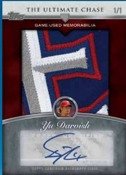
Ultimate Chase - Jumbo Patch Autographed Card

10 more individually designed and constructed cards will feature some of the biggest active and retired stars, with an autograph and a unique relic or a cut signature and a unique relic. Numbered 1 of 1.