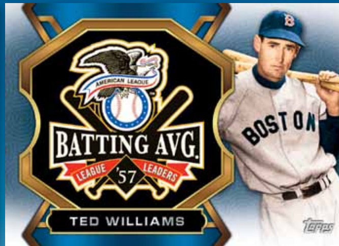
League Leader Pin Card