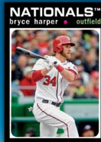
1971 Topps Mini Card