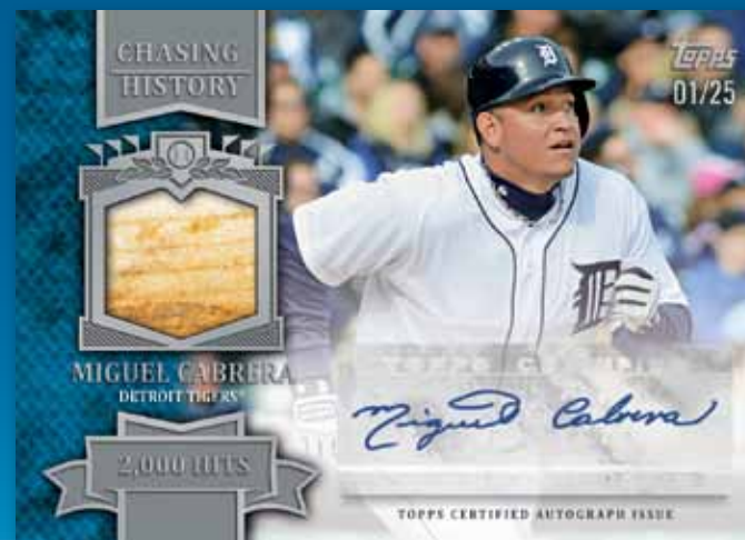
Chasing History Autographed Relic Card

Franchise Forerunners Dual Autograph Relics – 5 dual-auto/dual-relic cards. Numbered to 5. HOBBY & HOBBY JUMBO ONLY