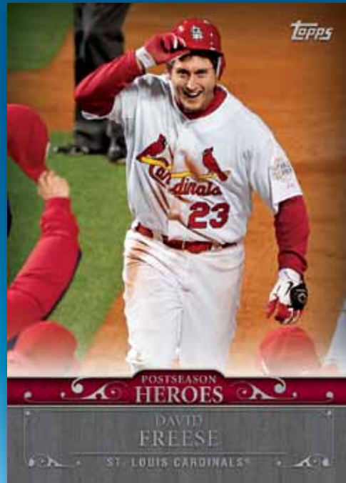
Postseason Heroes Card

Franchise Forerunners – 20 dual-subject cards pairing current Rookies with one of their franchise’s most famous Rookies from the past.