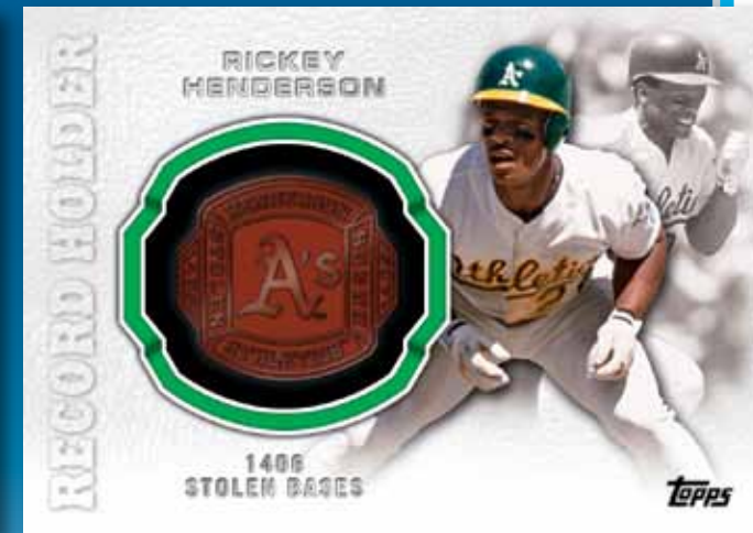
Record-Holder Ring Card