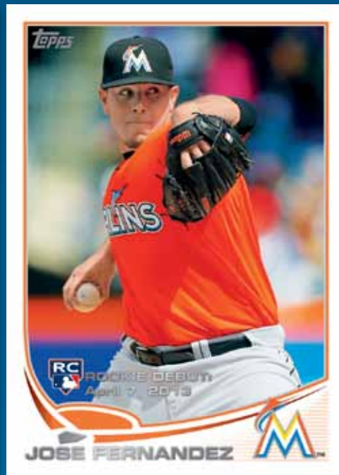
Base - Rookie Debut